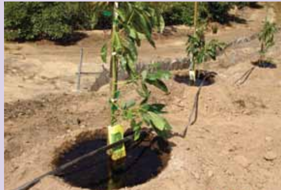
Transplants treated with BioFlora Dry Crumbles® and Humega®

Certified Organic Use: BioFlora Dry Crumbles® are screened for the pathogens EHEC, E.coli 0157:H7, Salmonella, fecal and total coliforms and Listeria by a certified third-party laboratory.