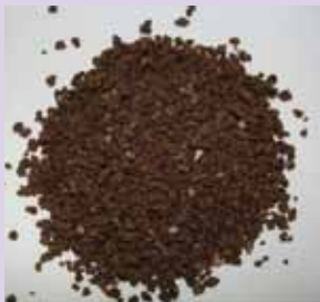
Fine Grade for Turf and Landscape