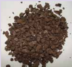
Coarse Grade for Agriculture

BioFlora Dry Crumbles® are designed for both pre-planting or continued fertilization throughout a growing season. These products are manufactured from high quality organic materials including feather meal, aquatic plant meal, organic acids and composted poultry litter.